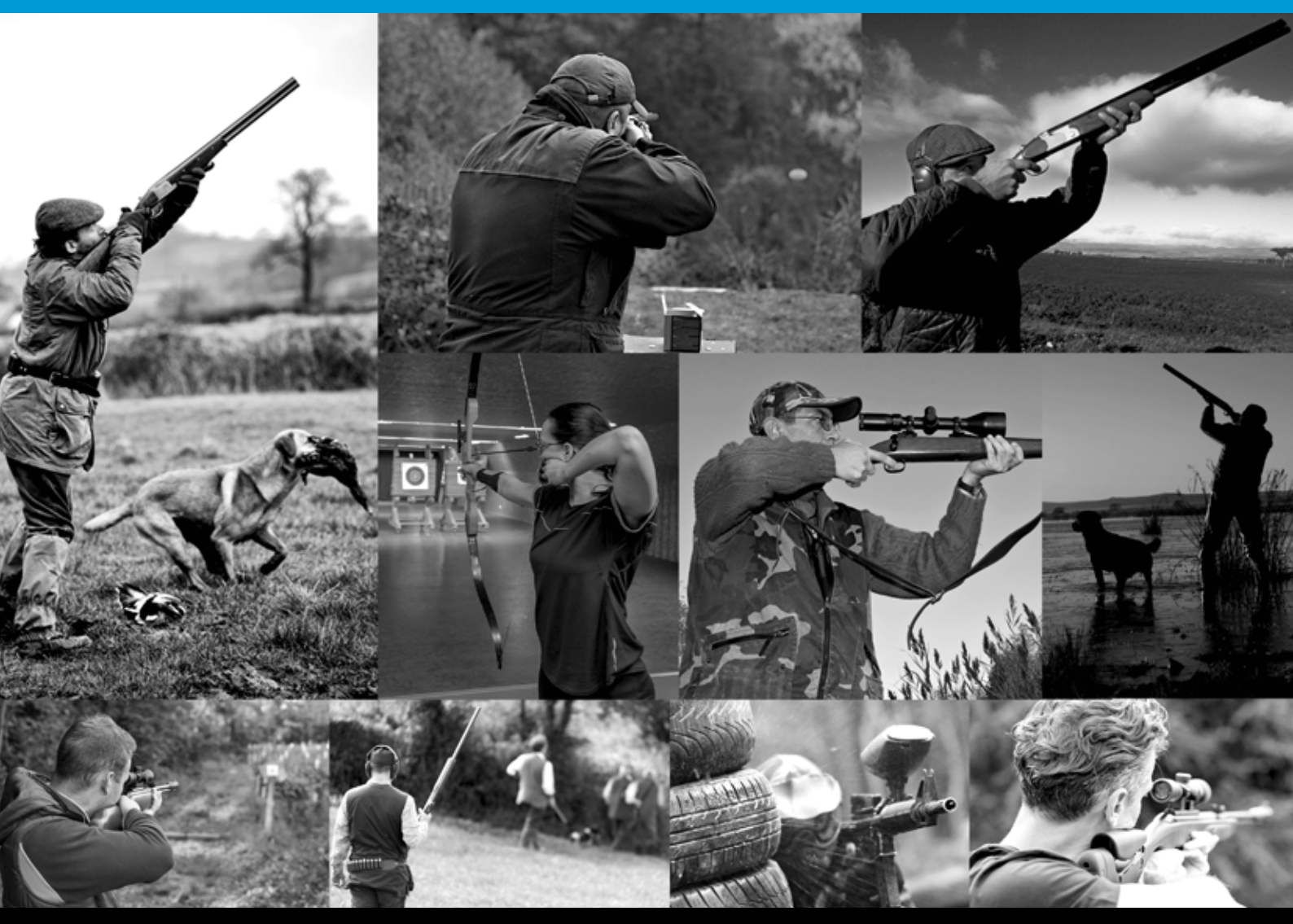
Gunplan® is a registered trademark and a trading name of Ripe Insurance Services Limited which is Authorised and Regulated by the Financial Conduct Authority. No. 313411.